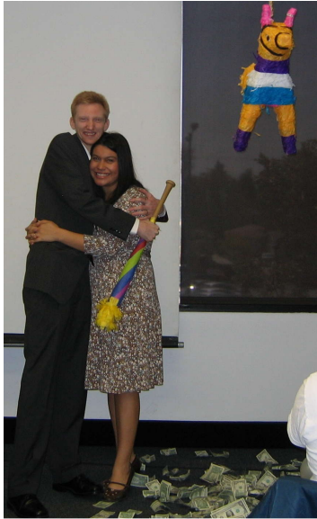
Mindset for Missions