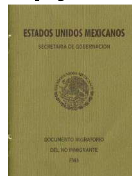
I'M FINALLY LEGAL!!!